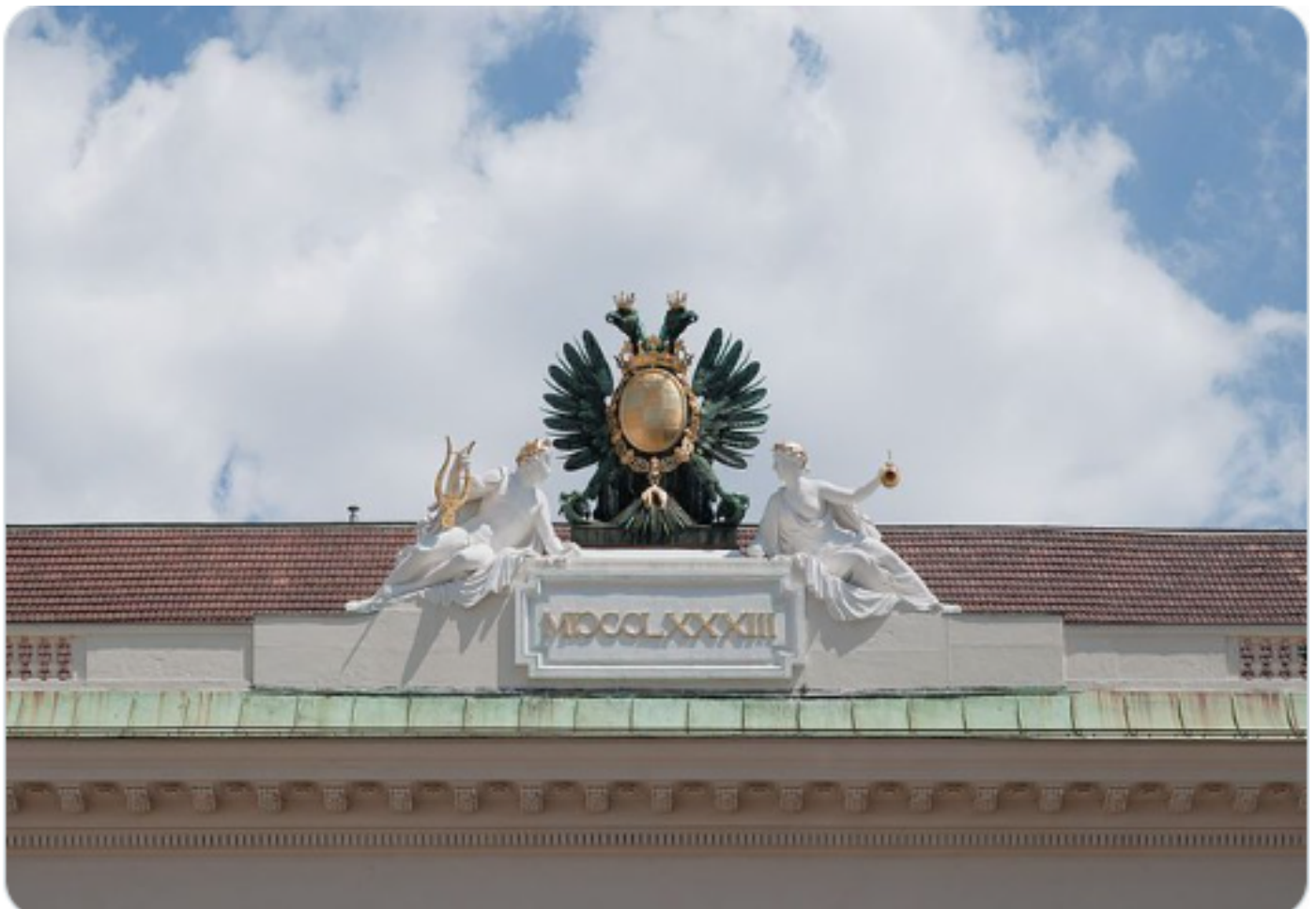
Pallavicini Palace Coat of Arms, Vienna, Austria.