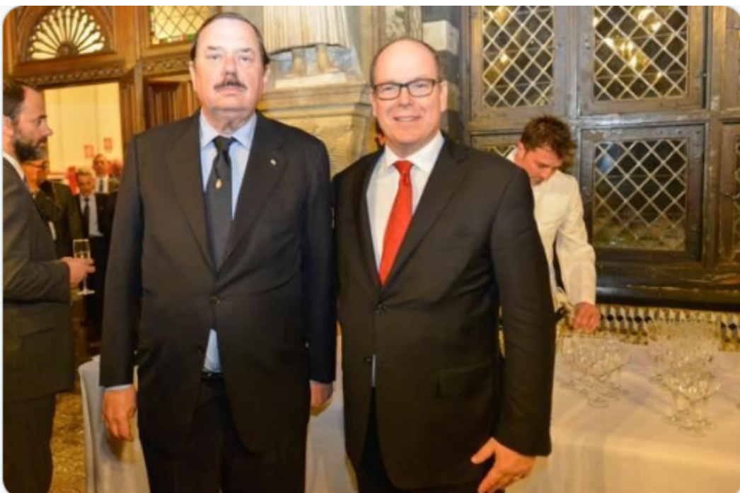
Domenico Pallavicino with Prince Alberto Grimaldi di Monaco

The Prince Domingo Pallavicino is a Genoese nobleman and works with Grimaldi's House in Monaco.