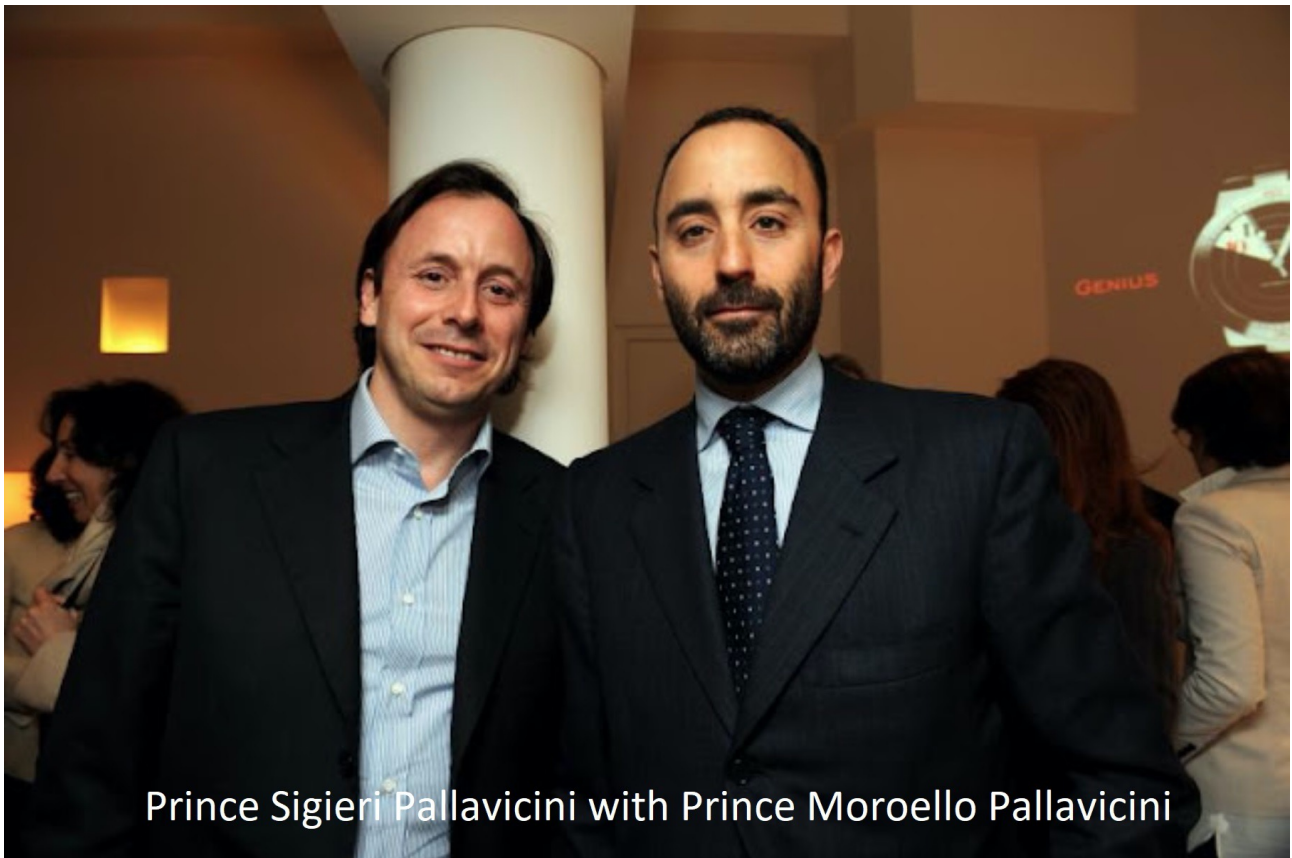
Prince Sigieri Pallavicini with Prince Moroello Pallavicini

Prince Moroello Díaz Della Vittoria-Pallavicini and the Prince Sigieri Díaz Della Vittoria-Pallavicini are two of the main powers in Rome and the world. The statue in the Pallavicini Palace holds a harp that refers to its authority over the HAARP system of the United States Air Force, used for mass mental manipulation and climate modification.