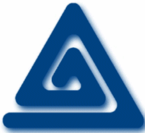
(U) BLogo aka “Boy Lover”