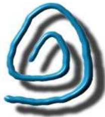
(U) LBLogo aka “Little Boy Lover”