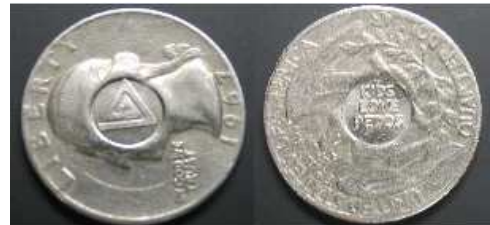
(U) BLogo imprinted on coins