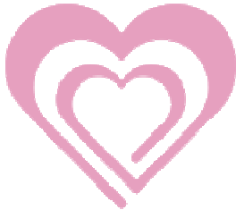
(U) GLogo a.k.a. "Girl Lover," Childlove