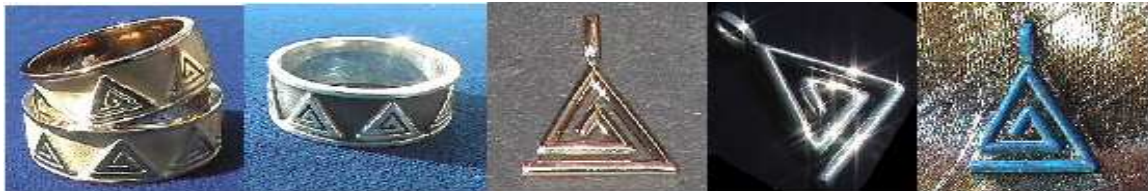
(U) BLogo jewelry